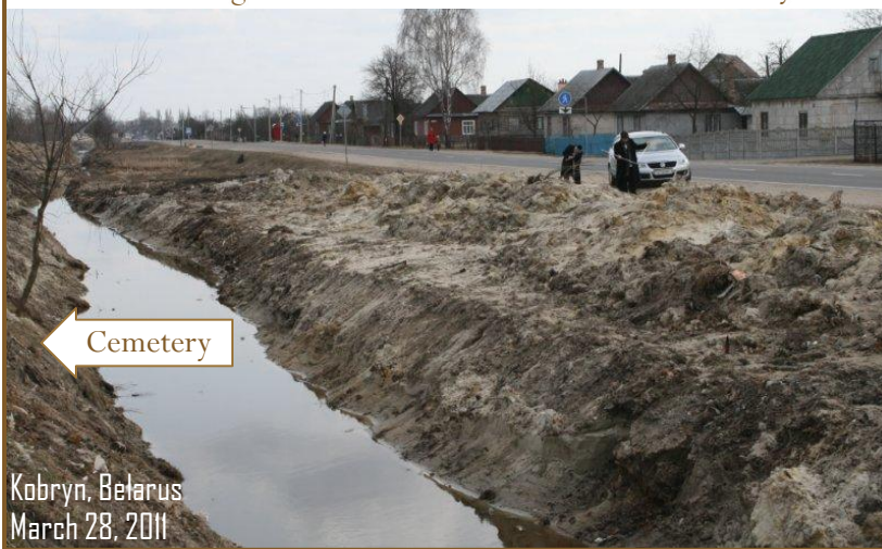
Kobryn, Belarus March 28, 2011

Gravesites in the cemetery have unfortunately been destroyed while creating a canal to transport water to the city. Photo shows HFPJC agents evaluating the situation while intervening to save the last remnants of this cemetery.