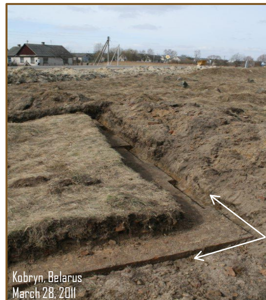
Kobryn, Belarus March 28, 2011

Photo of year 1943 helps determine the boundaries of the cemetery.