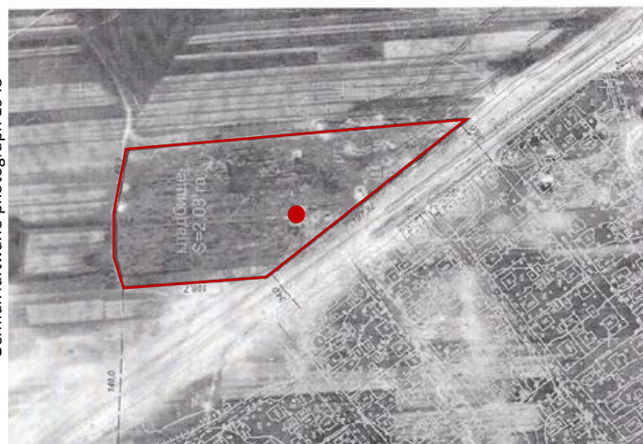
German luftwaffe photograph 1943

Photo of year 1943 helps determine the boundaries of the cemetery. Photo is a courtesy of Rabbi Levinger.