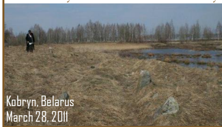
Kobryn, Belarus March 28, 2011

One of the lakes that have been dug out in the cemetery. Gravestones are seen nearby.