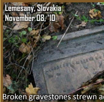
Lemesany, Slovakia November 08, '10