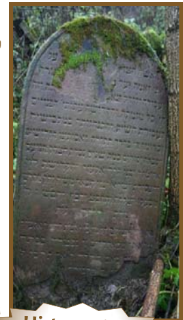
History of our Heritage