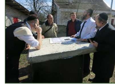
Negotiations with surveyors are underway