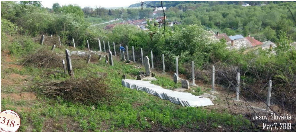
Jasov, Slovakia May 7, 2019

Rapid progress in placing the foundations surrounding the borders of the cemetery; work on fence continues