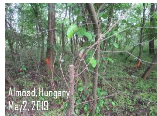
Almosd, Hungary May 2, 2019