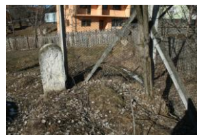
Cemetery awfully neglected