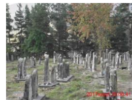
2018: Tombstone restoration