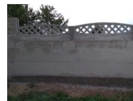
Construction has begun