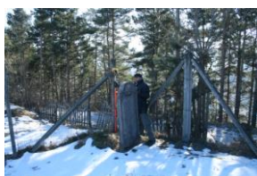
2009: Cemetery Evaluation