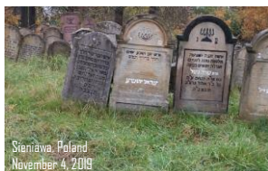
Sieniawa, Poland November 4, 2019

Beginning of preparations to repair all tombstones in the cemetery