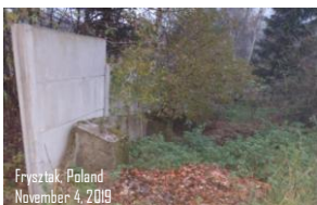
Frystik, Poland November 4, 2019