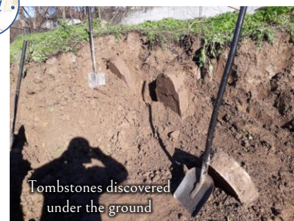
Tombstones discovered under the ground

Local neighbor finds 3 tombstones near his house and places it at the entrance to the cemetery; Avoyseinu agents upright the tombstones in the cemetery