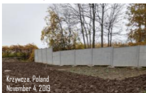
Krzyweza, Poland November 4, 2019

Excitement over the new fence; legal steps being continued to reclaim rest of the property; contacted אומל builder