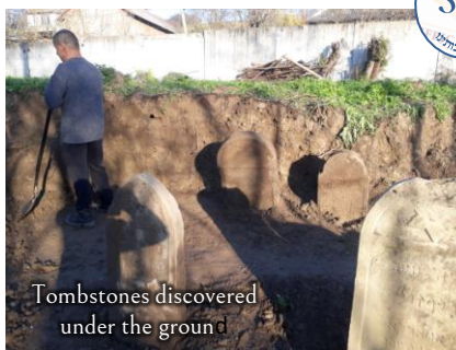
Tombstones discovered under the ground