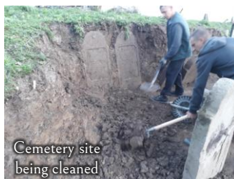
Cemetery site being cleaned

Phase 3: Mosdos Veretsky sponsors the clean-up job; many tombstones discovered under the ground and restored in the cemetery.