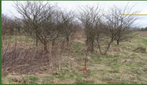
Holy site is neglected; construction of strong gate is needed